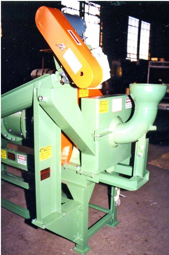
Mill Feed End with Drum Feeder and Feed Box with Spiral Classifier Return Launder