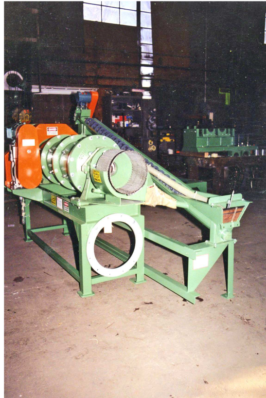
Mill Discharge End with Feed Launder to Spiral Classifier