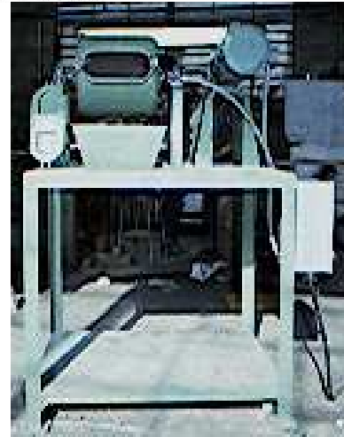
QPEC Bond Index Mill Full View